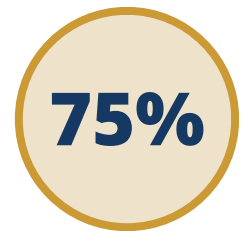
OVERALL SCORE FOR PLANNING FEATURES

Each municipality is scored on whether they have features that can support an efficient planning approvals system, and increase transparency for developers, the public, or other interested parties. This edition of the study makes some modifications to the review of features from the previous study. After an internal review and feedback of the scoring process from the previous study, the number of themes that include features within them has been reduced from five (5) to three (3). The total number of features being reviewed has been reduced from 16 to 13.